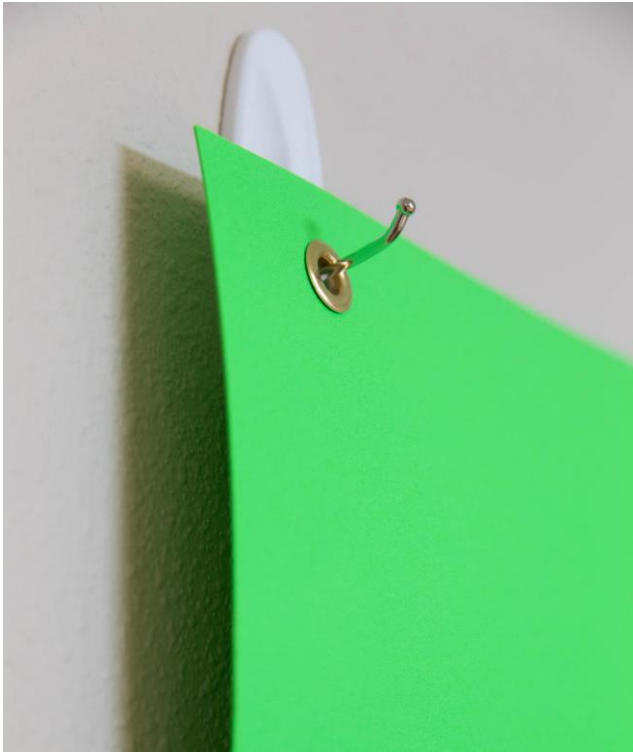
3M Command® Hooks