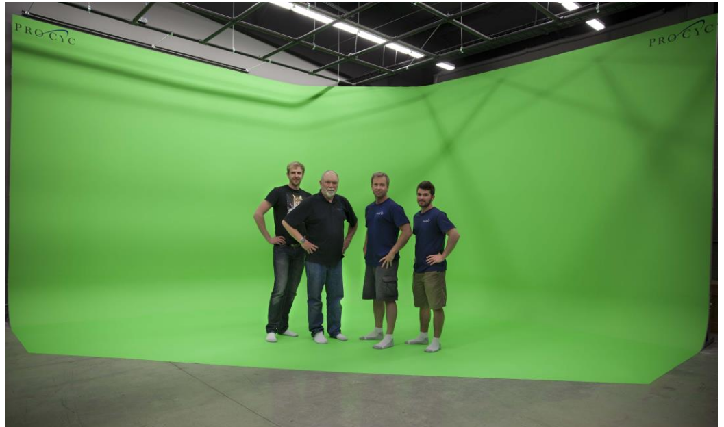
Super 1.5QS free-standing system installed with Pro Matte™ flooring

The new 1.5 systems are now made from the same high impact, lightweight ABS plastic that were previously only available with our larger systems. They are easier to install and much less costly to ship than ever before, making them an ideal solution for international installations where space and shipping costs are a factor.