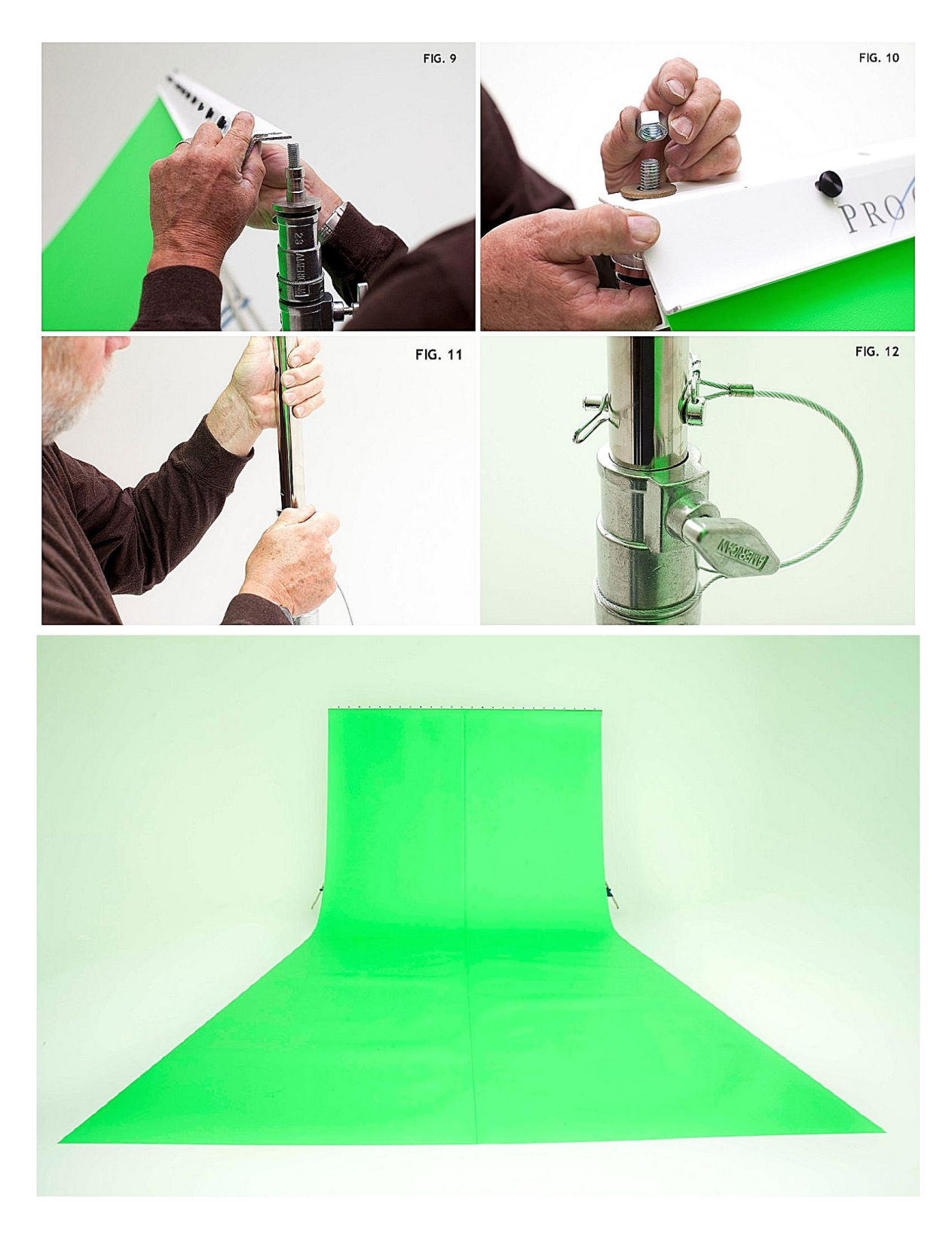
QR Code for Instructional Video: